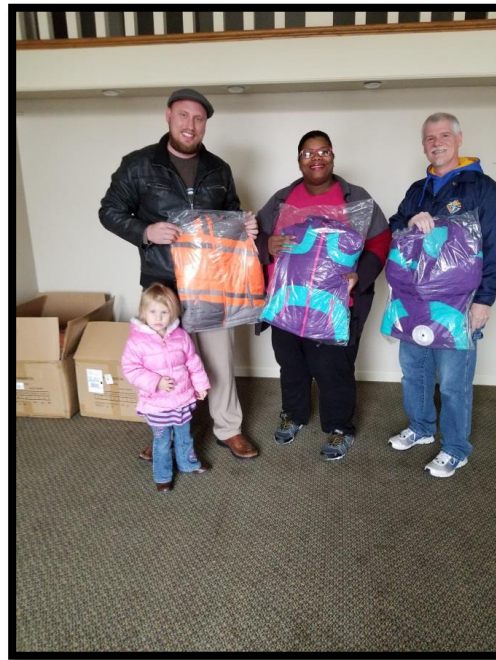
Catholic Charities Coat Donation